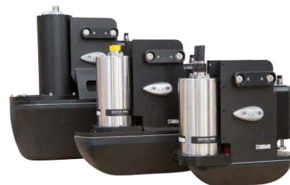
125 kHz, 250 kHz and 500 kHz transducers