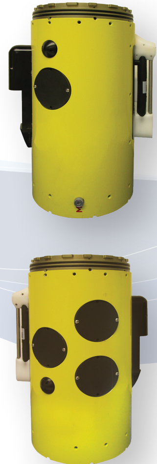
Science Bay Module (left and right views)

The Gavia Science Bay Module can be delivered with pre-installed sensors at the factory or can be used as a payload module for custom sensor integration by the user.